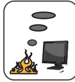
No Corrosive Gas Emission IEC60754-2