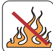
Fire Resistance IEC 60331 /NF C 32070-2.3(CR1)