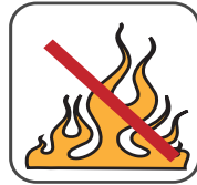
Flame Retardancy NF C32-070-2.1(C2) IEC60332-1-2/EN50265-2-1